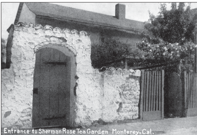
An early 20th-century postcard of the entrance to Casa Bonifacio. Hidden in the foliage is a small sign stating, "Sherman Rose."